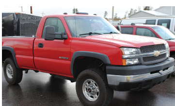
2003 SILVERADO 2500 HD. Z-71, bedliner. AS LOW AS $229 A MONTH