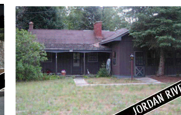
2452 MARTINSON DRIVE., EAST JORDAN Fantastic home and location with access to the river and snowmobile trails. 320' of Beautiful frontage on the famed Jordan River. Pole barn for extra storage. MLS 435491. Ask for Mike Stark. $159,900.