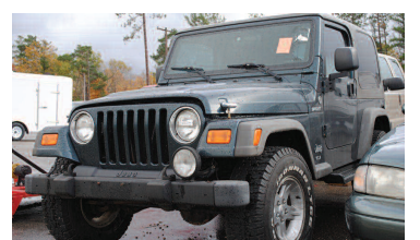
2005 JEEP WRANGLER TJ SPORT Trail rated, 4x4, removable hard top AS LOW AS $199 A MONTH