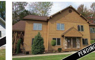
2100 W SCHUSS MOUNTAIN, BELLAIRE Newer building located on the 1st green on the 2nd tee of the popular Schuss Mountain Golf Club. Lower interior unit. Close to ski slopes. MLS 438696. Ask for Mike Stark. $57,900