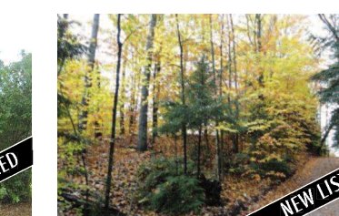
3626 PESEK ROAD, EAST JORDAN Picturesque 5 acre parcel . Right across the street is almost 100 acres owned by the Little Traverse Conservancy MLS 436770. Ask for Jennifer Burr. $10,000

109 MILL STREET • EAST JORDAN • 231-536-7700