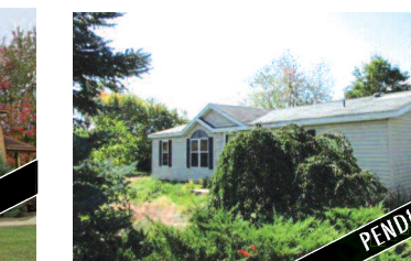
110 REVIERRA DRIVE, EAST JORDAN Home is in a nice location close to town. Needs some TLC but has the potential to be a nice family home. Private road. MLS 438761. Ask for Mike Stark. $39,900