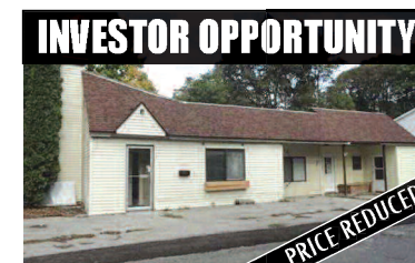
233 CEDAR STREET, BOYNE CITY Tri-plex with excellent rental history. All three units have had many updates. 3 Units cash flow equal $1,750. MLS 435092. Ask for Jennifer Burr. $115,900