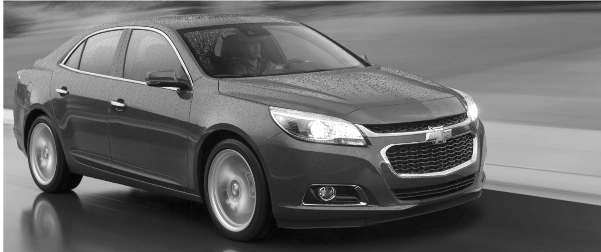
Chassis and suspension updates contribute to the 2014 Malibu's more refined driving experience, including re-bound springs that are internal to the struts. They enable more refined calibration of the dampers for a smoother overall ride, while also improving body roll control and weight transfer during acceleration or turning."