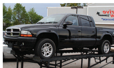
2004 DODGE DAKOTA SPORT QUAD CAB 4x4, soft tonneau cover, powerful V-8, only 84 K. AS LOW AS $199 A MONTH