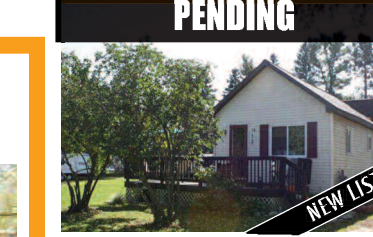
405 UNION STREET, EAST JORDAN What an amazing backyard, a fire pit with hand carved logs to sit on for entertaining, great landscaping and a deck too. MLS 438606. Ask for Holly Nierman. $74,900