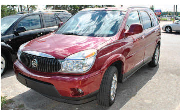
2007 BUICK RENDEZVOUS XL Leather, sunroof, 3rd row seat. AS LOW AS $199 A MONTH.