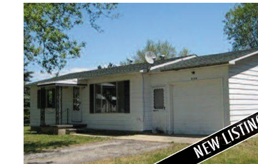
4183 CINDER HILL ROAD • ALBA Newly remodeled 2 bedroom home on a double lot with an attached garage. This would make a great getaway spot close to skiing and snowmobiling. MLS 438758. Ask for Holly Nierman. $46,000