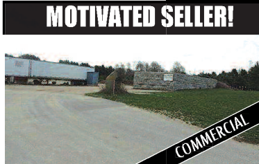
112 BARTLETT STREET, EAST JORDAN Commercial property right in town with a convenient location. Zoned C2, currently used as a trucking yard. Driveway in place. MLS 436755. Ask for Jennifer Burr. $40,000