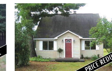
320 OLD STATE ROAD, BOYNE CITY Close to town but still far enough out of the way and off the main road. Many updates to home including a new 6" well in June 2013. MLS 438008. Ask for Mike Stark. $114,990