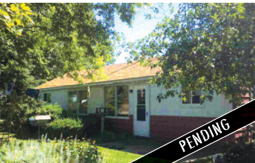
07748 ROGERS ROAD, EAST JORDAN This stick built home is in a great location close to town. Two beds, with the possibility of a third. Fenced back yard...MLS 438405. Ask for Chris Oliver $59,000