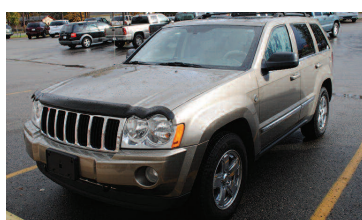
2005 JEEP GRAND CHEROKEE Leather, loaded, 4x4. AS LOW AS $199 A MONTH