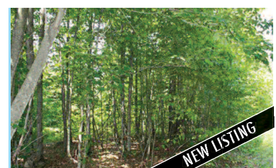
TBD AUNT FERNS DRIVE, EAST JORDAN Great 10 acre parcel, this would make a great place to build a home or just a get away for deer camp. MLS 438227. Ask for Holly Nierman. $15,000