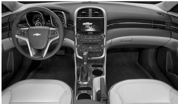
The 2014 Chevrolet Malibu's redesigned center console has a longer armrest, providing greater comfort and storage room for two cell phones and a pair of cup holders. The available Chevrolet MyLink for the 2014 Malibu delivers enhanced connectivity and convenience, with the new Text-to-Voice feature for smartphone users and Siri for iPhone users. PHOTO © GENERAL MOTORS."

The available Chevrolet MyLink for the 2014 Malibu delivers enhanced connectivity and convenience, with the new Text-to-Voice feature for smartphone users and Siri for iPhone users. Each enables voice-controlled connectivity. Text-to-Voice converts incoming messages to speech, reads them over the audio system speakers and allows the driver to reply with preset messages such as, "I'm